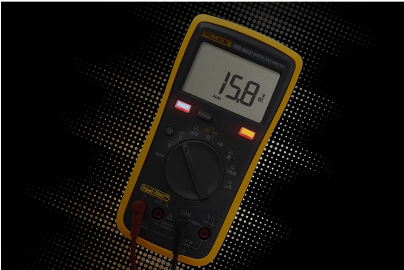
Audible and visual alarm for incorrect connections